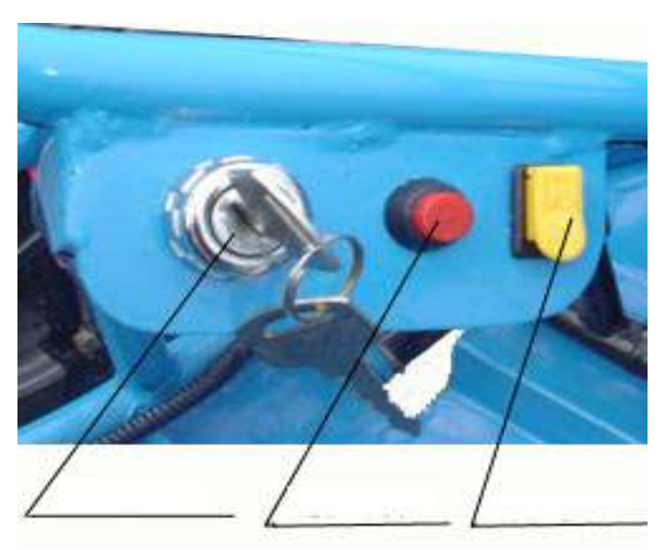
Ignition Key Blanket Switch Horn Switch

Control Panel (Ignition Key and Blanket Switch)